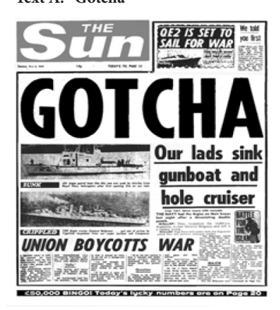
Text A: "Gotcha"